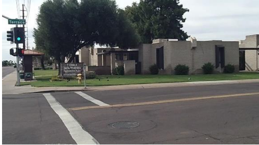
Terra Southern Medical/Professional Plaza