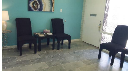
Waiting room Suite F-1