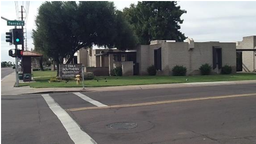
Terra Southern Medical/Professional Plaza